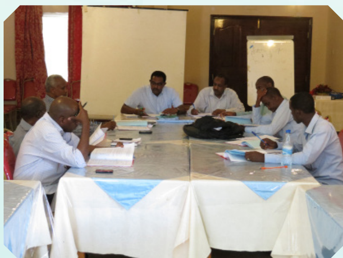
RCC meeting in Hargeisa, Somaliland - April 2013

The project will also actively involve other FAO projects, especially FSNAU in activities of common interest such as Somali public institutions capacity development and agro-meteorological monitoring.