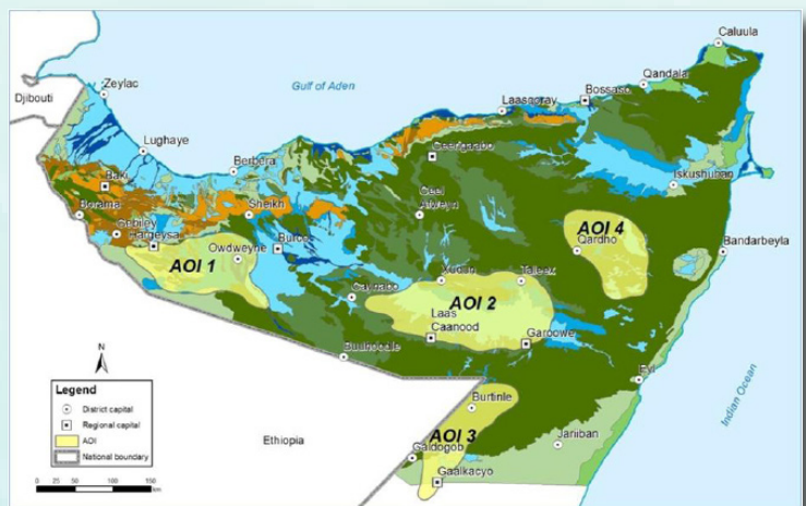
Regions of Somaliland & Puntland showing assessments of selected aquifers

The study produced a classification and characterization of groundwater aquifers at a scale of 1:750,000 and detailed assessment of selected aquifers in the two regions at a scale of 1:250,000. Over 340 water samples were analysed for common compounds and heavy metals. The survey results indicated that there are many challenges that have to be addressed to develop groundwater resources in the region. Among other things, the study found out that more than 70% of the water sources in the region exceed World Health Organization (WHO) limits of drinking water for numerous minerals, more so salinity.