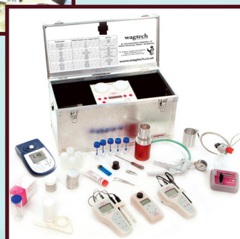
Water quality testing kit used in the Hydrogeological Survey