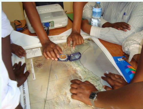
Training in map reading

As part of capacity development, the project has made great strides in the area of training. In the just concluded SWALIM Phase IV, 56 training sessions involving 552 participants were conducted; of which 228 were in Somaliland, 191 in Puntland and 133 in Nairobi. The training sessions address a wide range of topics from general computing, report writing, water and land resources data collection, information management and mapping among others.