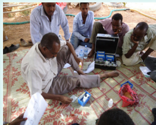
Soil Training in Garowe Puntland

The greatest achievement during SWALIM IV in the area of land resources was the realization of the Land Degradation Monitoring Systems. During this phase, SWALIM produced a practical guide for land degradation monitoring in Somalia. Among the contents of the practical guide were the types of land degradation that require monitoring in Somalia, the persons responsible for monitoring, location of monitoring sites with their X and Y coordinates, periodicity of monitoring in the sites, field monitoring planning, methods for land degradation planning, time required for field monitoring, locating the monitoring sites in the field using GPS (Global Positioning System), data collection and equipment and materials needed for the monitoring activity. The methods for monitoring land degradation in Somalia focus on the two major land degradation processes identified during SWALIM III, namely soil erosion and vegetation loss.