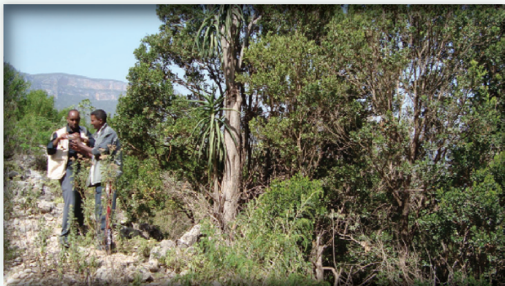
Field Survey in Golis Forest

The Land theme group also actively participated in several professional and product dissemination workshops and retreats, besides offering outstanding support to other SWALIM units and FAO sectors like the Cash For Work (CFW), agriculture and environment sectors. Support to the CFW team involved monitoring irrigation canal rehabilitation, agriculture and water infrastructure rehabilitation and the impact of irrigation canal rehabilitation on crop production between 2008 and 2010. The result of this activity included a summary atlas detailing the interpretation key used in the analysis, with 78 primary canals analysed, 40 grid units developed and a total of 5 768.297 hectares deduced as the impact on crop growing.