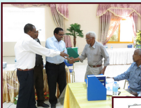
Launch of the Hydrogeological Survey in Hargeisa - Somaliland