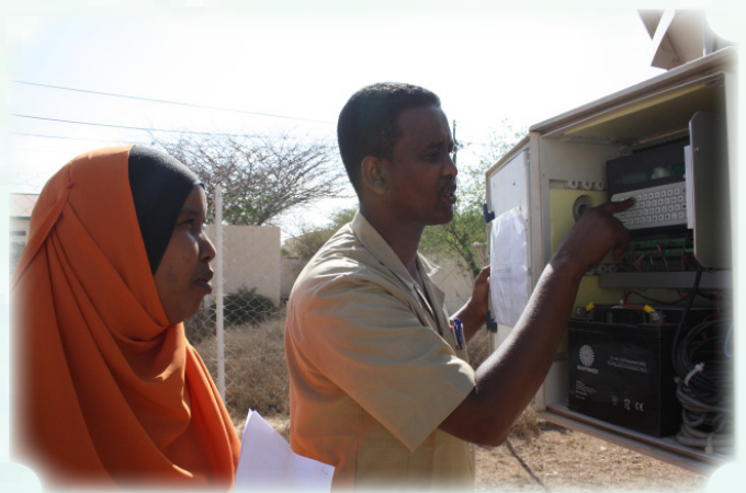
Data centre staff at Ministry of Agriculture - Somaliland

Water and land information systems, including SWIMS, CDI, FRRMIS and IIMS were improved and further developed for ease of use. The products generated by these systems were served through the Client Service Platform which was further developed to allow users to access a variety of information to support their day to day operations in the areas of emergency, rehabilitation and development. A total of 388 interventions by UN agencies, local and international NGOs, government, academic and private organizations were supported by SWALIM water and land information. The information was used in a host of ways including developing proposals, undertaking field assessments and monitoring and evaluation of projects.