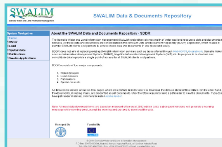
The SDDR structure

All SWALIM publications and other rare publications lost during the civil strife that have been recovered from different organizations are available in the publications section. SWALIM applications provides installation files for all information management applications developed by SWALIM.