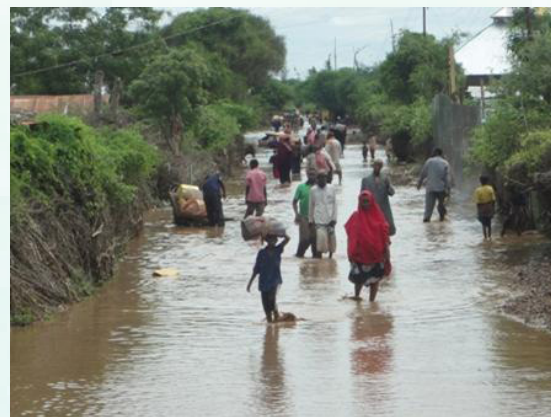
Displaced persons vacate their homes in Wanle Weyne following flooding during the Gu Rains of 2013

The floods in Southern Somalia that began in mid April caused extreme human suffering and economic damage. In April over 2000 households were displaced by the floods. If the heavy rainfall pattern persists in May, which is highly likely, the number of displacements could rise. Since the devastating 2006 floods in the region several other floods have occurred in the same region in 2009 and 2010. The story of flood disaster and its attendant destruction of lives and property is the same throughout the years and this is likely to remain the same if nothing is done.