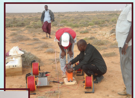
Fieldwork during the hydrogeological survey