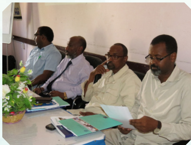
Puntland Line Ministers with SWALIM CTA - April 2013

SWALIM Phase V was launched in February 2013. The project will run for a period of 48 months and will address the necessary development and use of SWALIM information on water and land resources by relevant institutions and other users in Somalia. The project is expected to contribute to sustainable private sector led economic rural development and support food security for populations affected by droughts, floods and resource based conflicts by increasing the use of water and land information in resources management, early warning, preparedness, response and resilience building in Somalia. The project was largely based on the "Concept of a future Somali water and land information system" developed by FAO-SWALIM together with Somali partners and endorsed by all major stakeholders. The capacity of Somali public institutions and other stakeholders involved in management of water, land and other natural resources will be further developed and consolidated to facilitate eventual transfer of the project to the relevant Somali authorities. The information systems, including the monitoring networks will be updated and where appropriate further developed.