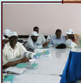
Participants at the Hydrogeological Survey launch in Puntland