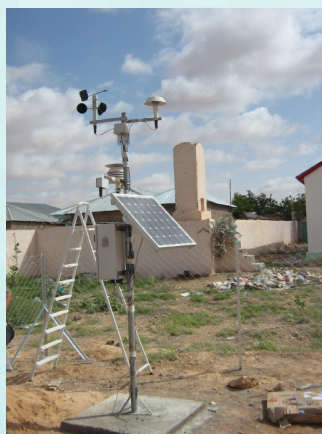
AWS in Garowe

To support interventions in the irrigation sector, a well structured system of collecting and managing past and present information on irrigation infrastructure, the Irrigation Information Management System (IIMS) was developed. The IIMS provides information (both spatial and tabular) on ongoing and planned irrigation projects. It gives users of irrigation data a platform to know what is available, the ability to query the system for specific datasets and to download data in different formats.